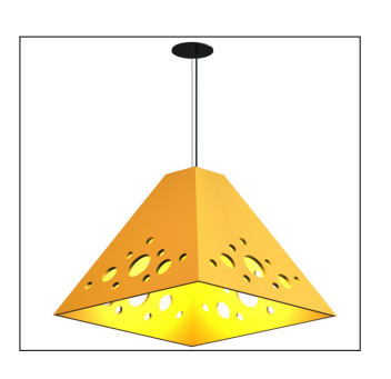
PS - PERFORATION