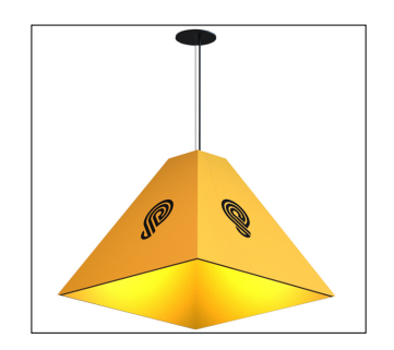
ES - ENGRAVE