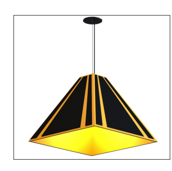
LS - LAYERS