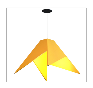
CS - CUSTOM CUT