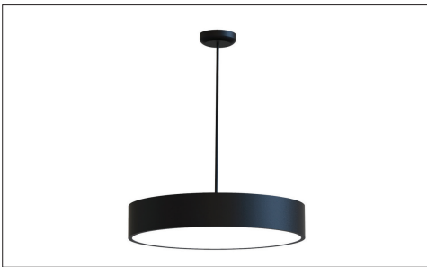
SUSPENDED - STEM