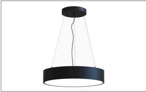
SUSPENDED - CEILING CANOPY