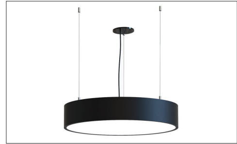
SUSPENDED - STRAIGHT WIRE