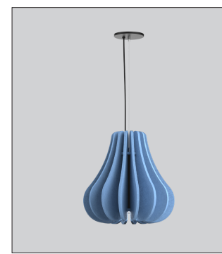
TD-Tear Drop *